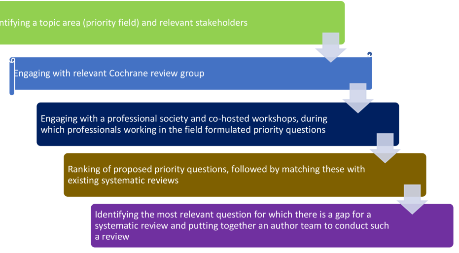
Figure 3 Priority setting process in the Southern-Eastern hub.